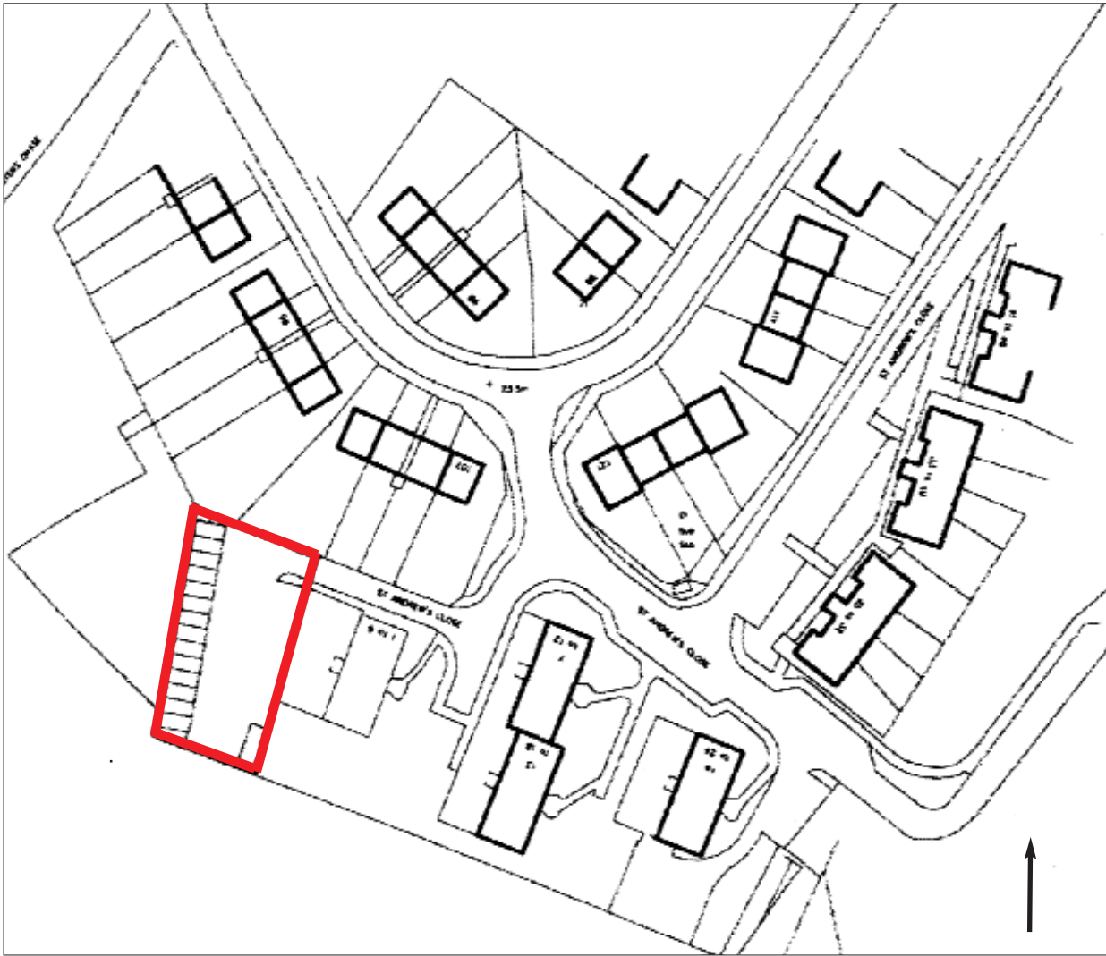
Figure 1. Location of site (in red line).