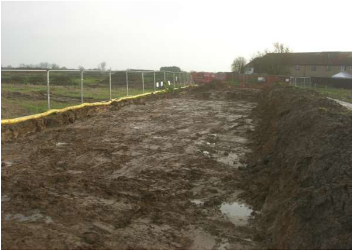
Plate 4. Phase 1. Topsoil strip. Plate 5 (below) Phase 2. Cutting trench for pipe