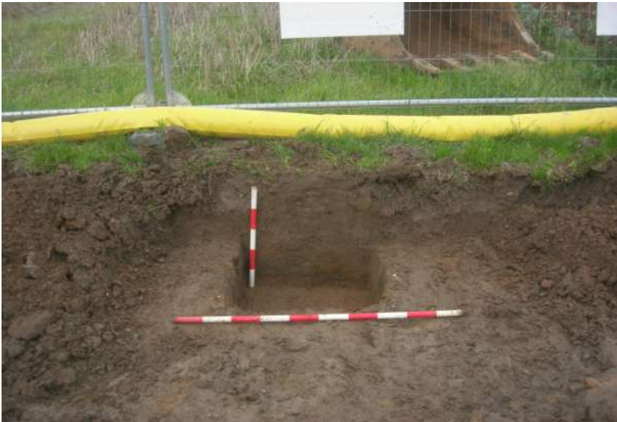
Plate 2. Test Pit showing depth of topsoil and subsoil. Plate 3 (below) Test Pit showing depth of topsoil and subsoil.