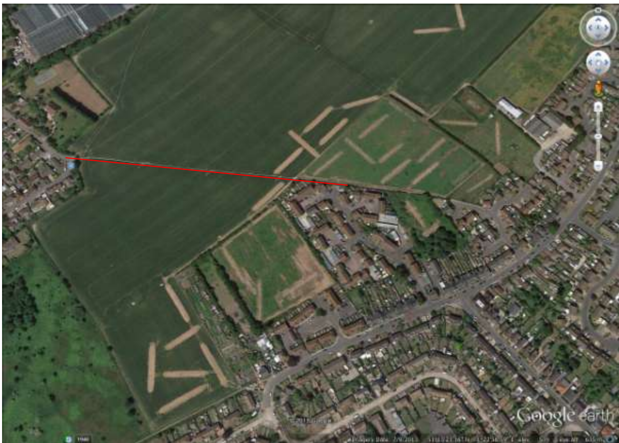
Plate 1. Aerial view showing the route of the pipeline.