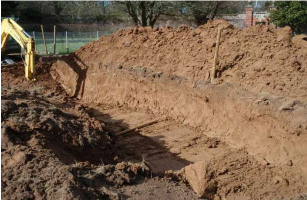
Plate 5. View of site showing reduced levels (Ha-ha 2)