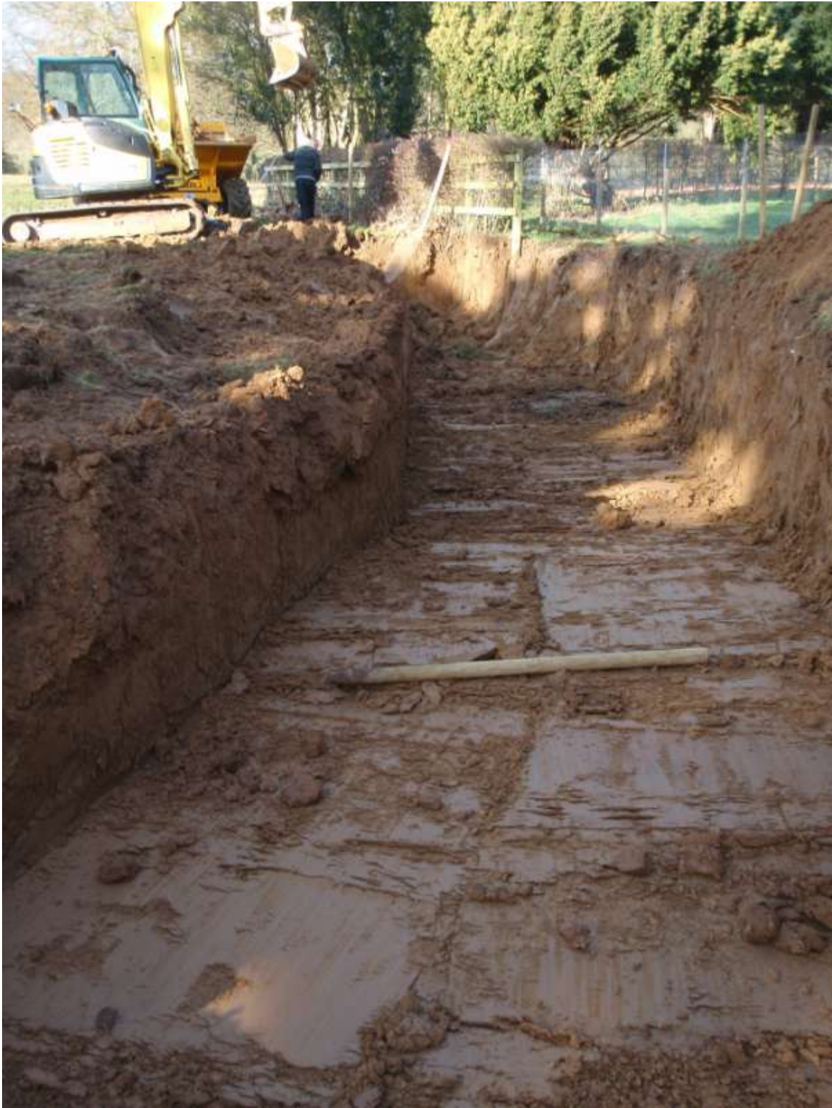
Plate 4. Phase 2, Digging Ha-ha 2 before profiling (Looking west )