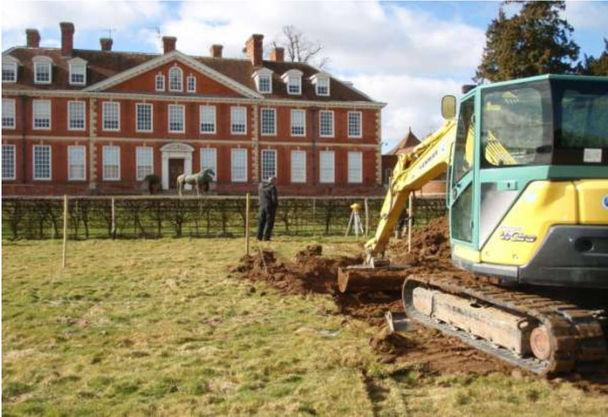
Plate 2. Phase 1, view of the site during topsoil strip and (Plate 3) subsoil strip