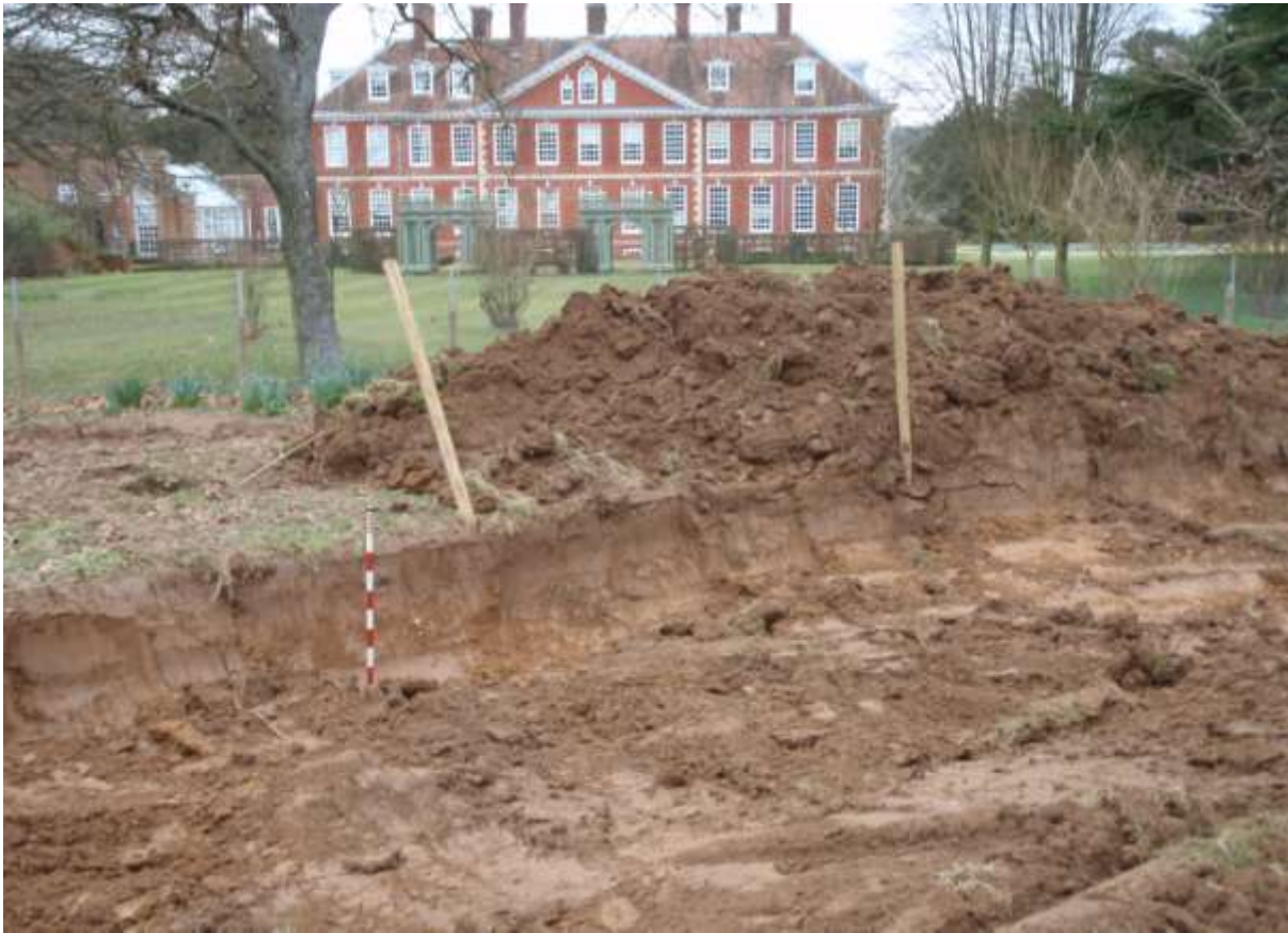
Plate 6. Reduction of Ha-ha 2 (looking south west)