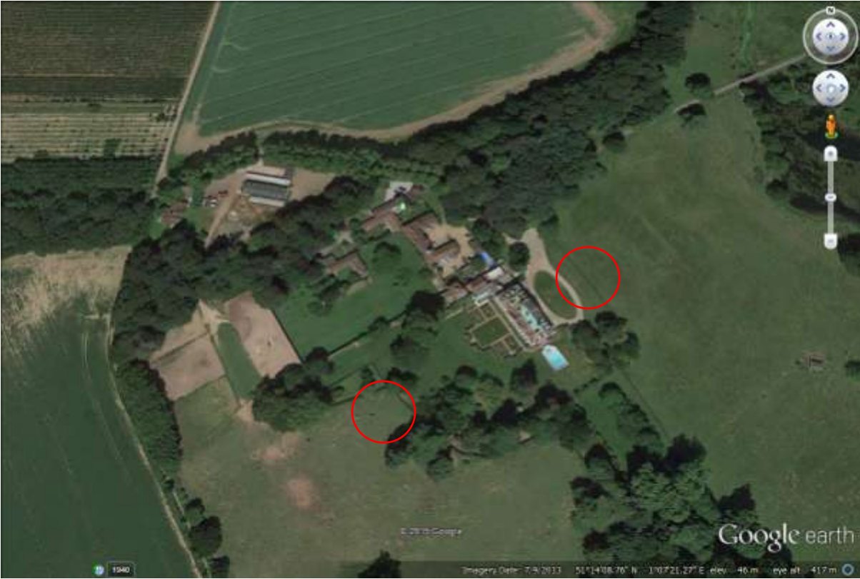
Plate 1. Aerial view showing the sites prior to development.