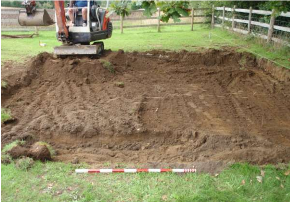
Plate 3. The site showing removal of topsoil (looking west)