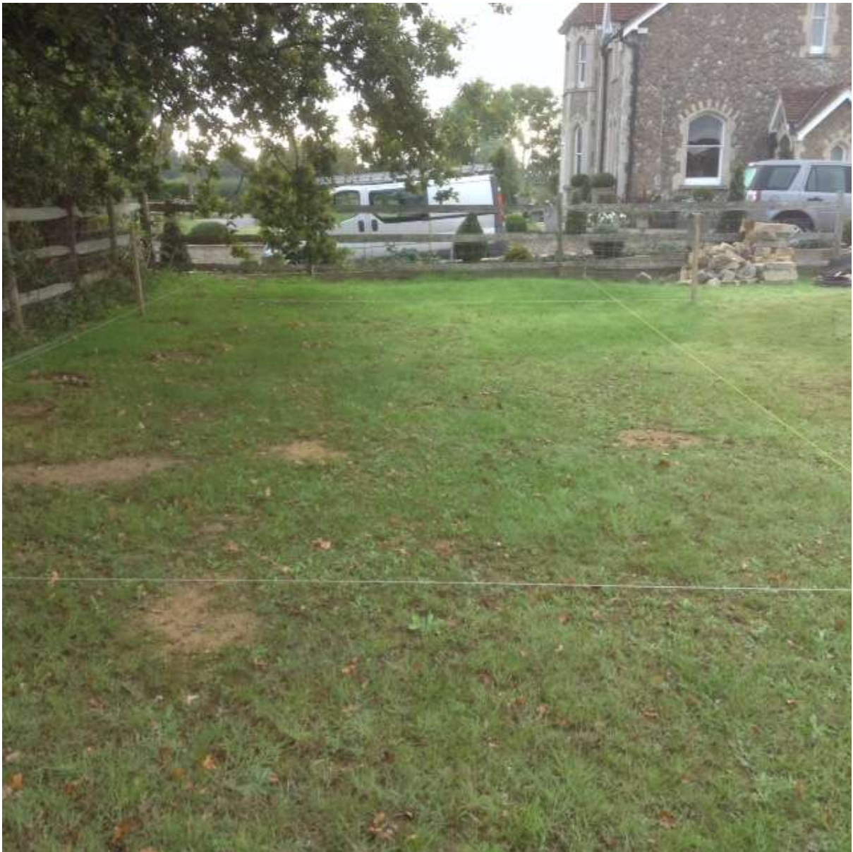
Plate 2. General view of site (looking east)