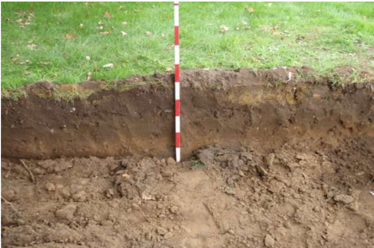
Plate 4. Section on east side