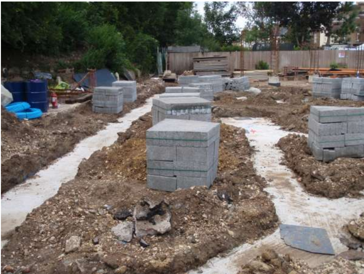
Plate 5. Completed foundation trenches (facing north)