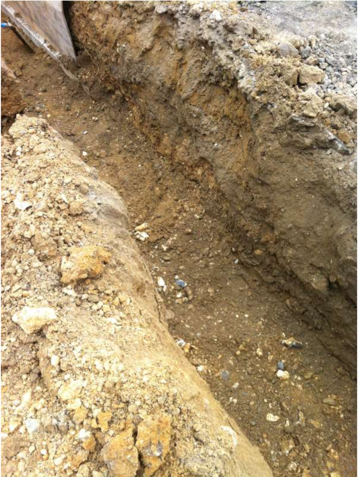
Plate 3. Close-up of foundation trenches showing made-up ground