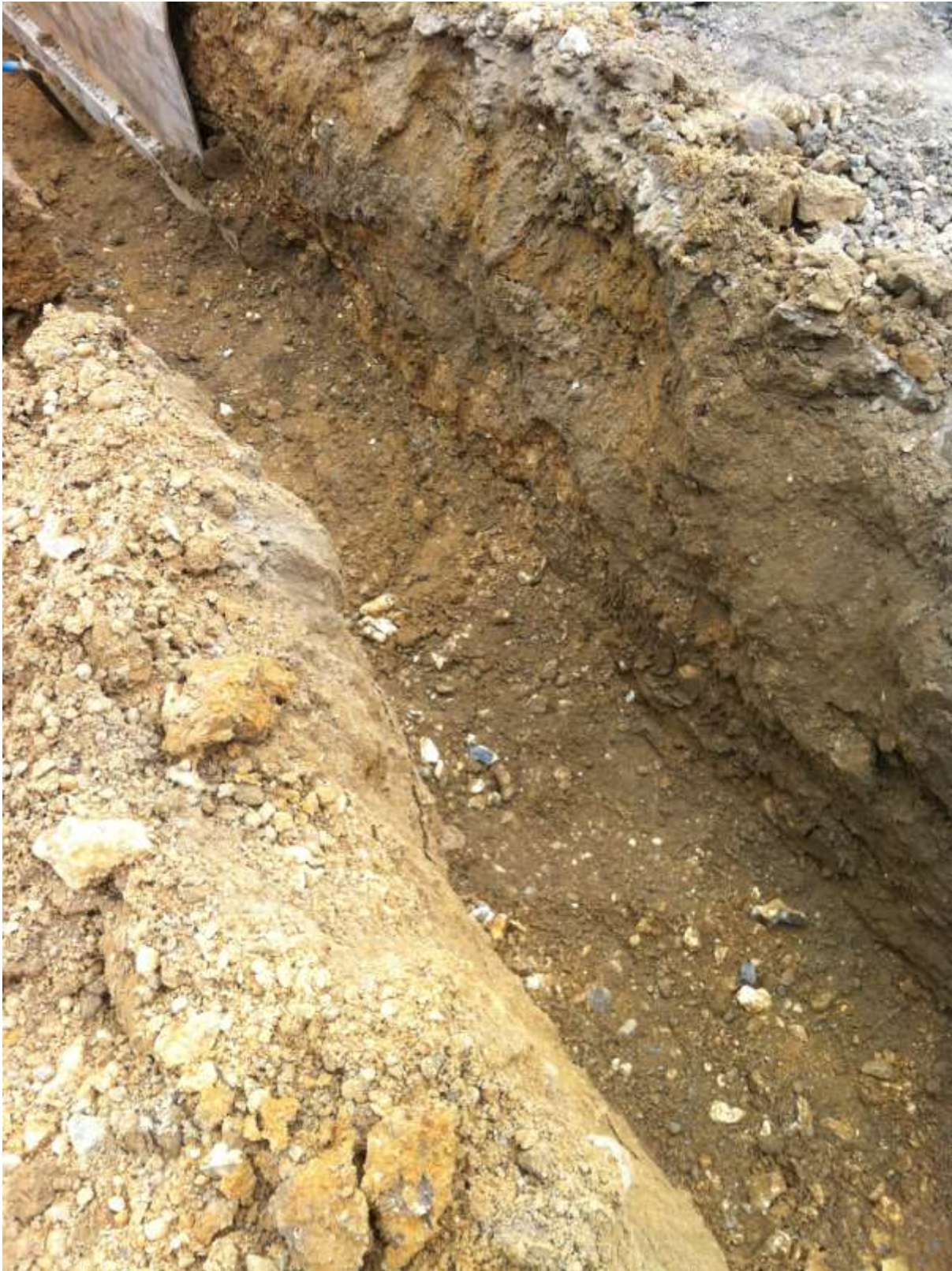
Plate 3. Close-up of foundation trenches showing made-up ground