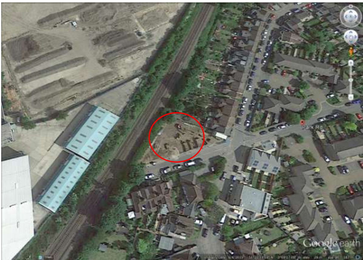
Plate 1. Aerial view of site (red circle) showing the site undergoing development.

(Google Earth 04/06/2015: Eye altitude 170m)