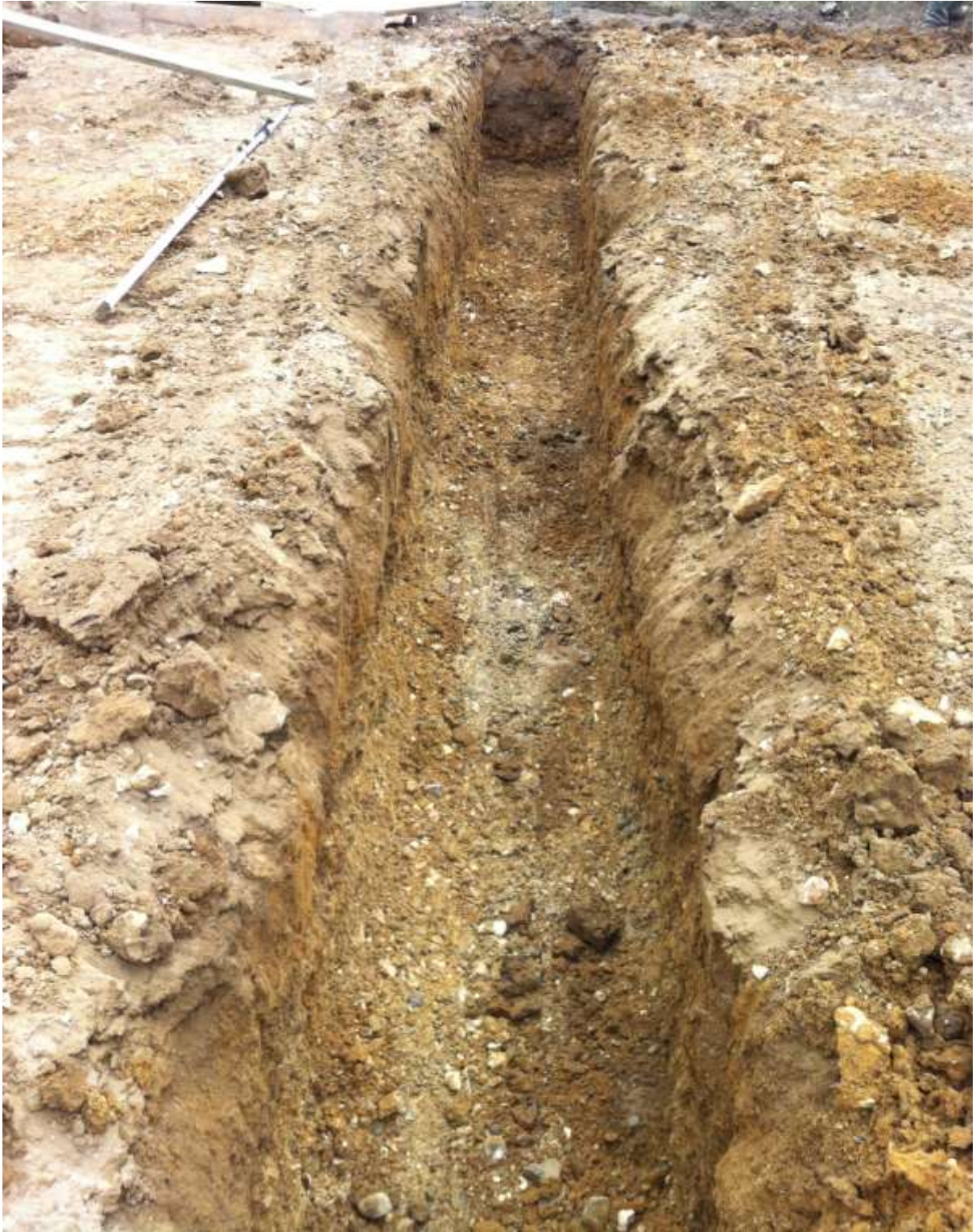
Plate 2. Close-up of foundation trenches