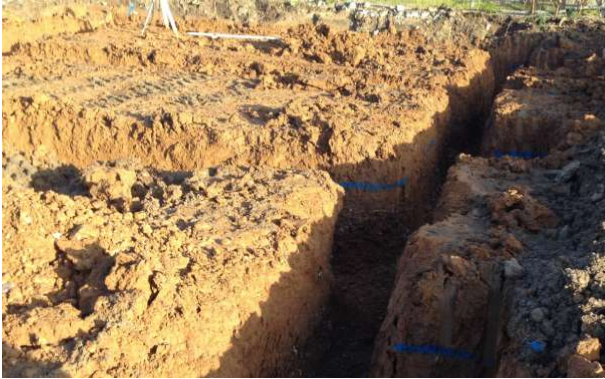
Plate 4. Foundation trenches completed