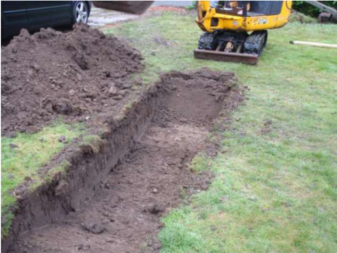
Plate 3. Trench 1