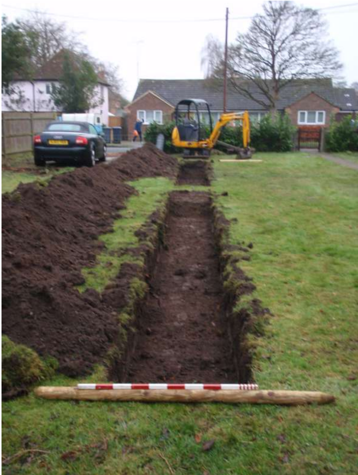
Plate 5. Trench 1 & 2