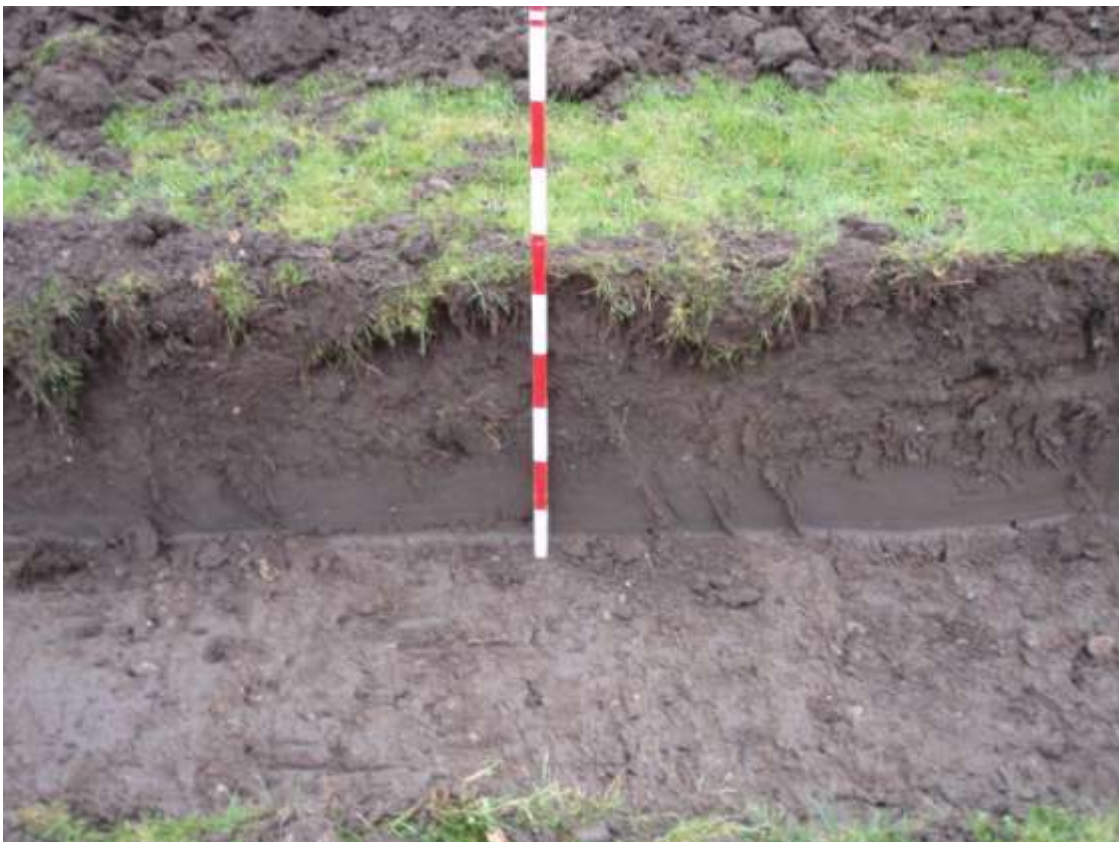
Plate 4. Trench 1 Section