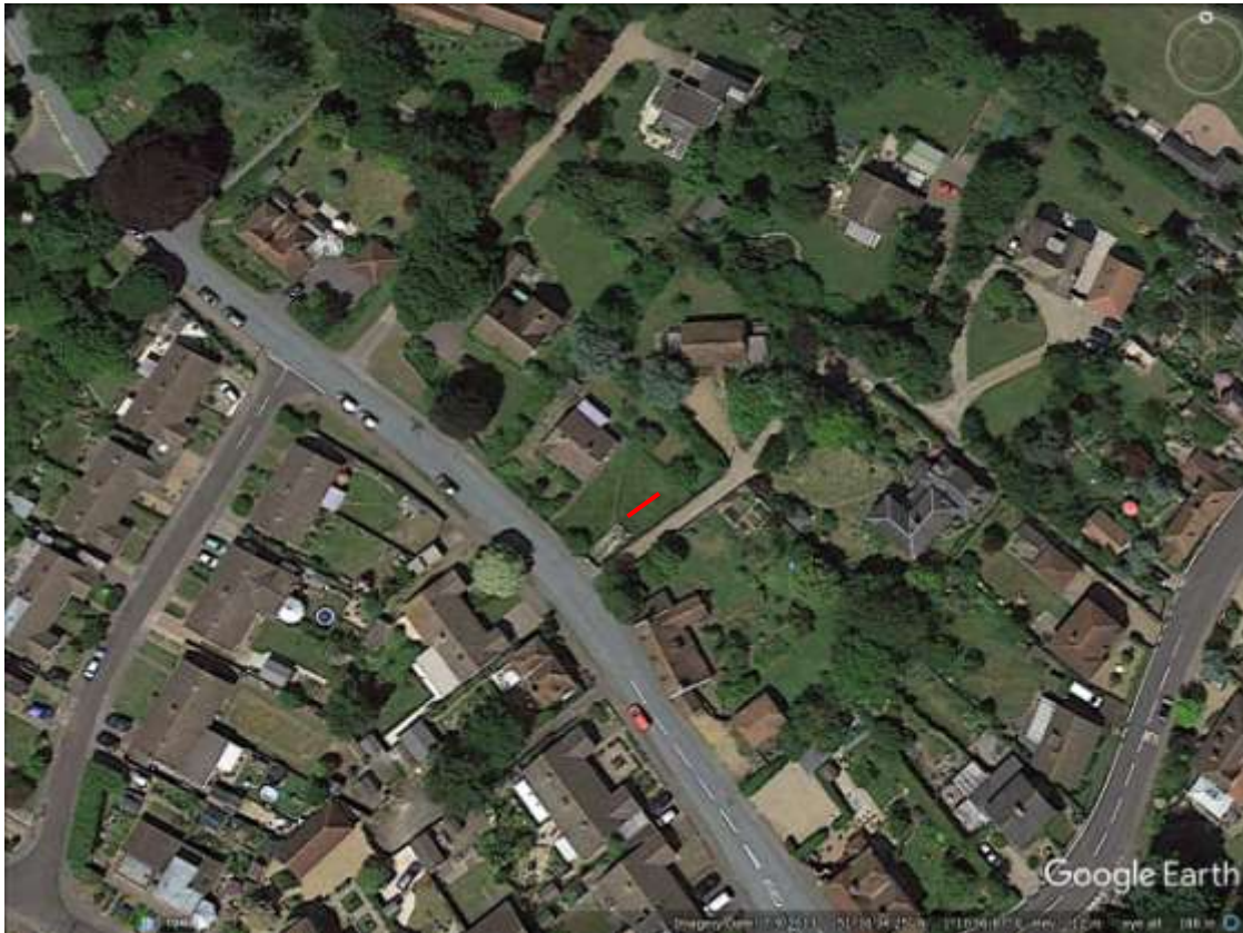
Plate 1. Location of site and trench (Google Earth 2013)