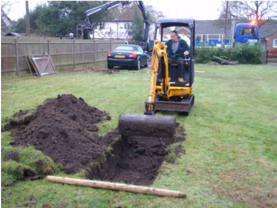
Plate 2. The development site (looking south)