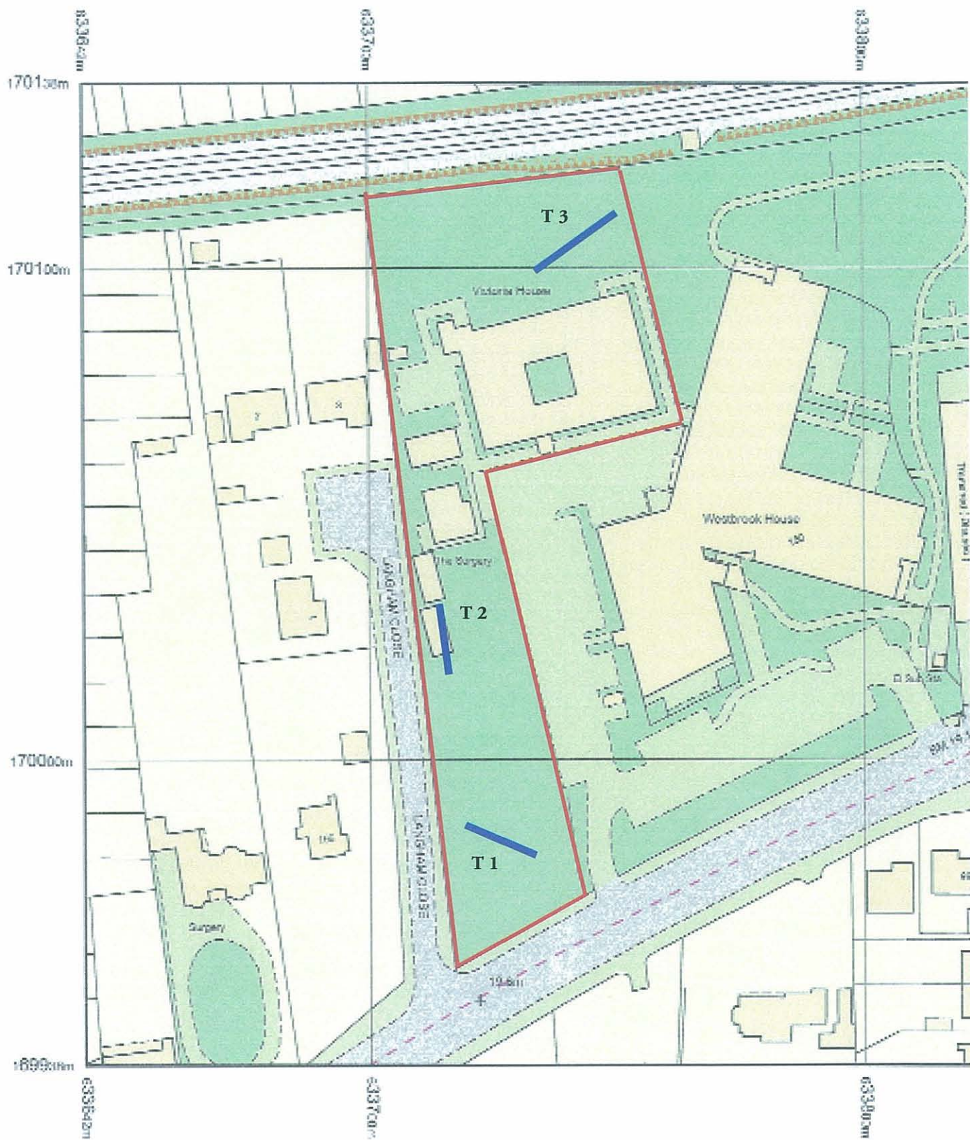
Figure 2. Location of evaluation trenches within the Development Site.