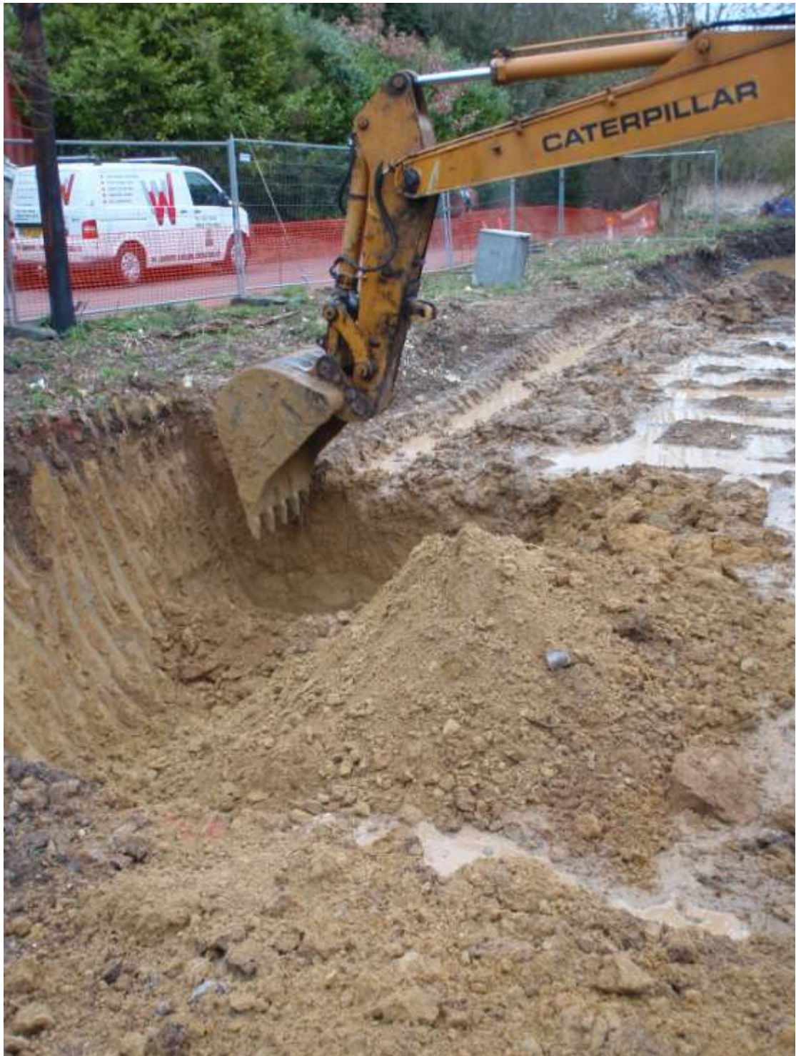
Plate 2. Showing deep excavation after topsoil strip for cellar of new building