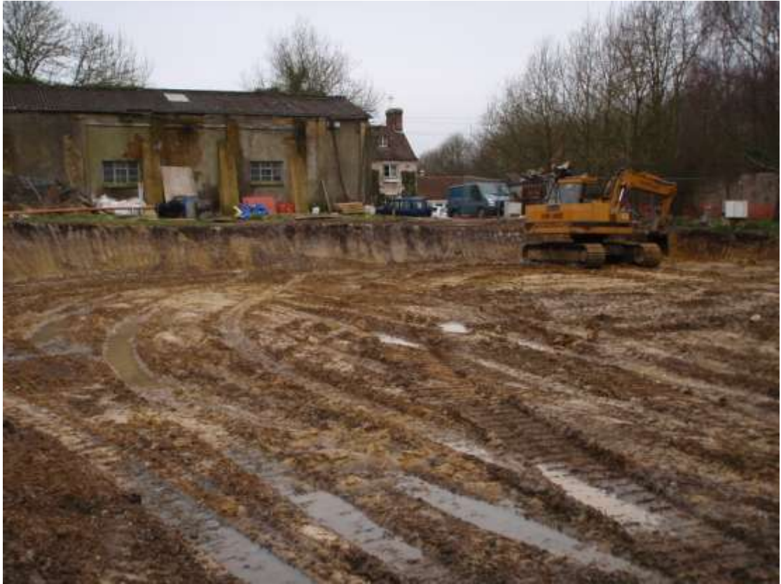
Plate 3. Showing area excavated and watched (facing south-west)