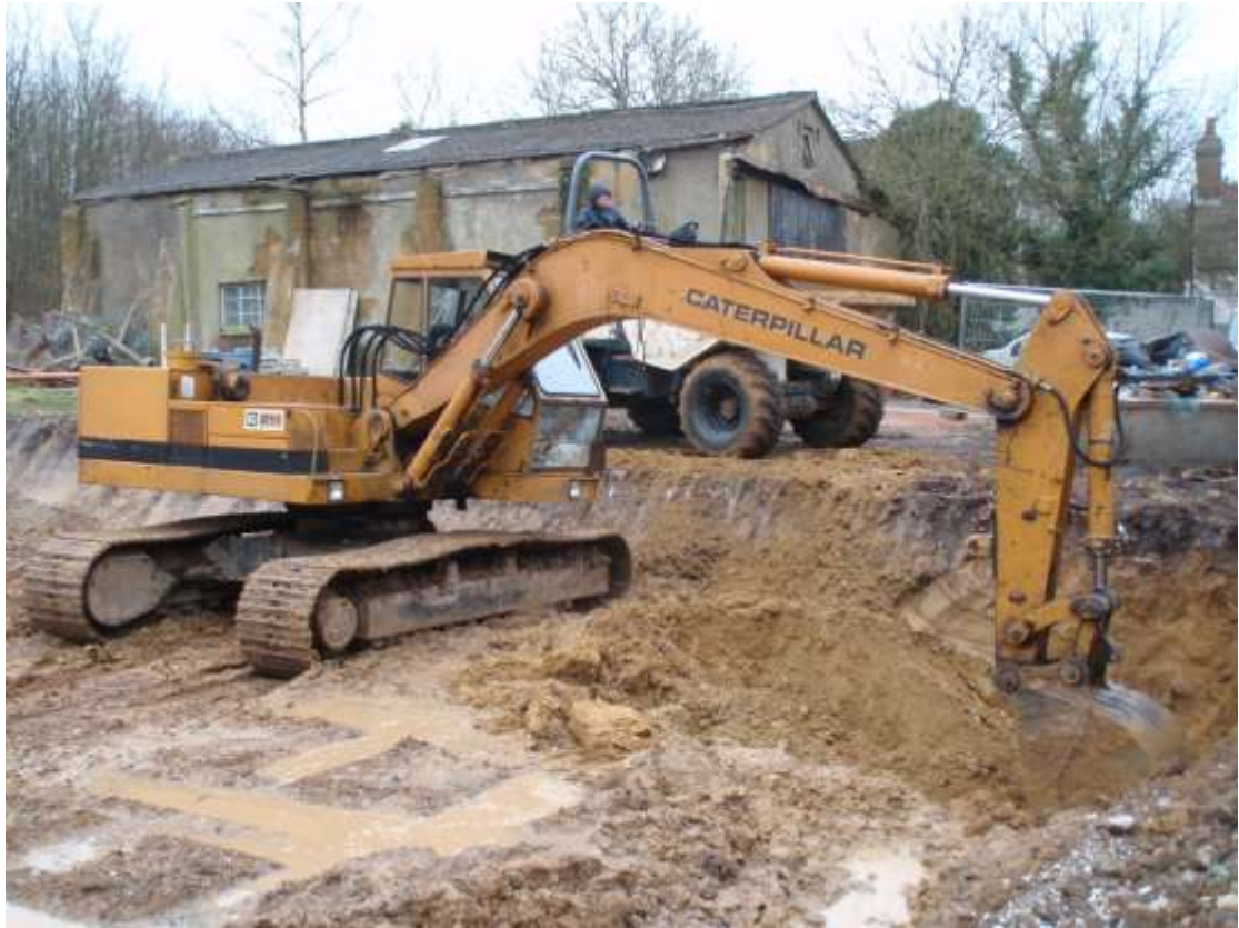
Plate 1. Showing excavation for cellar of new building