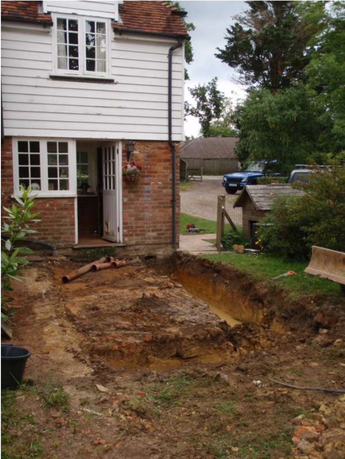
Plate 3. Phase 1. Trenches being excavated (looking east)