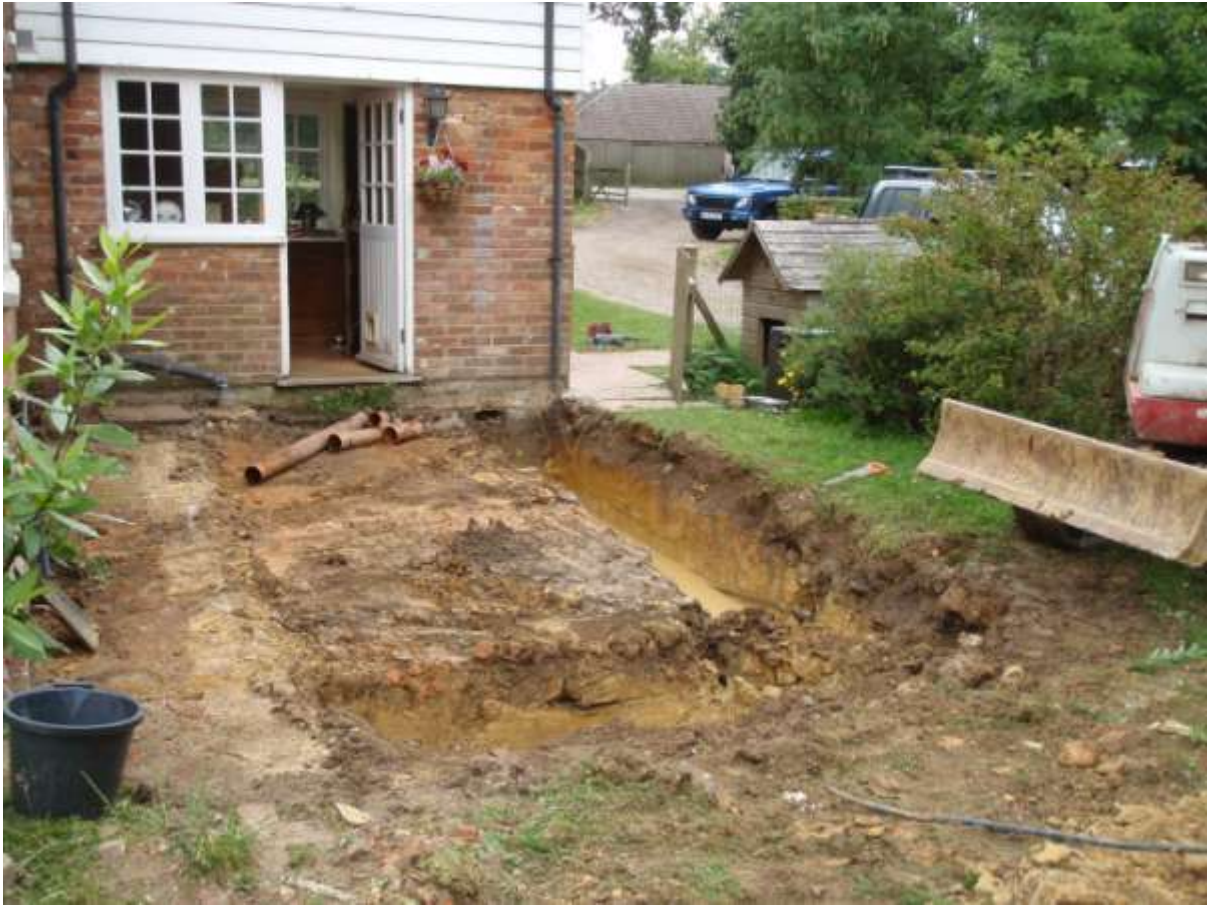
Plate 4. View of site showing site trenches (looking west)