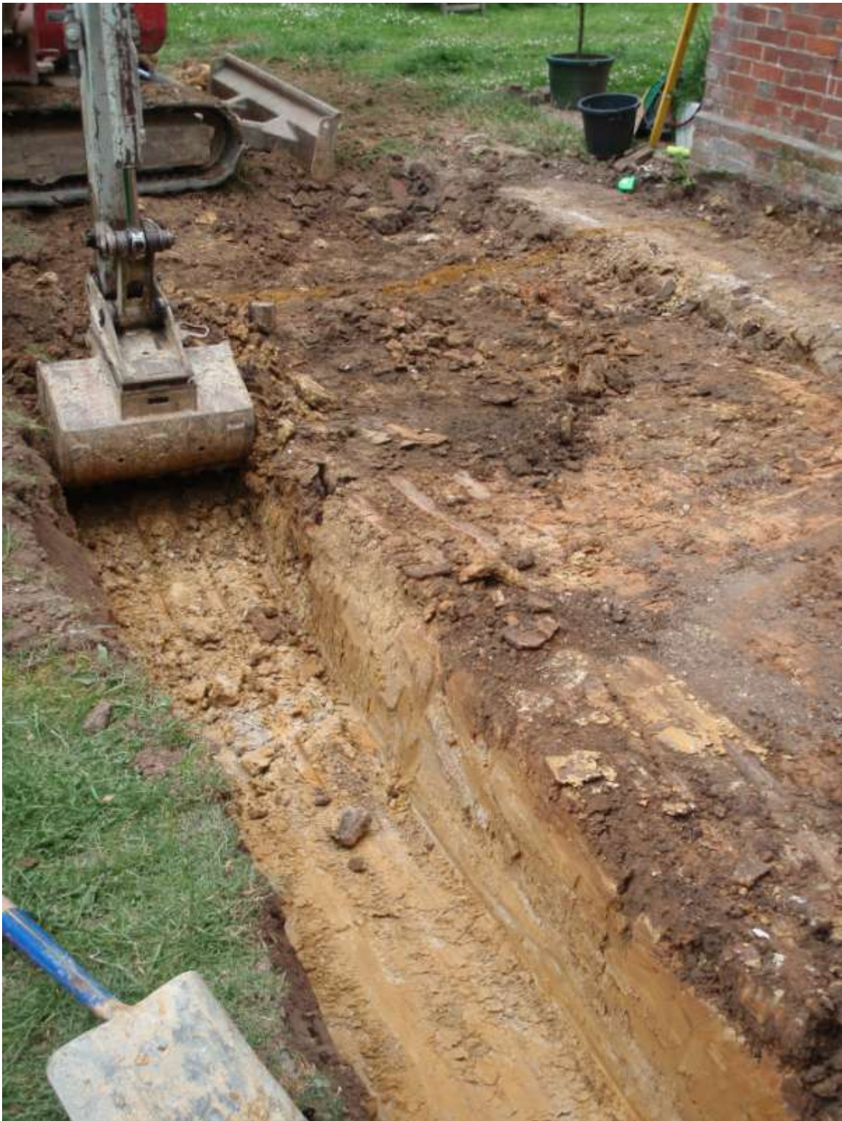
Plate 2. Phase 1, view of the site after part topsoil strip (looking west)