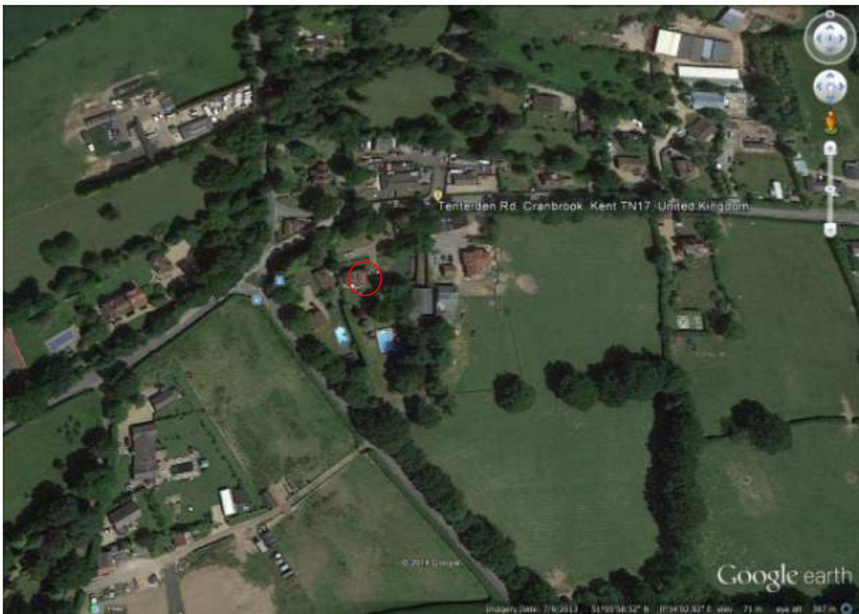
Plate 1. Aerial view showing the site prior to development.