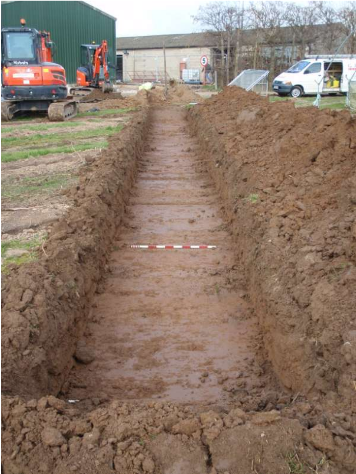
Plate 3 – Trench 1 (looking NW)