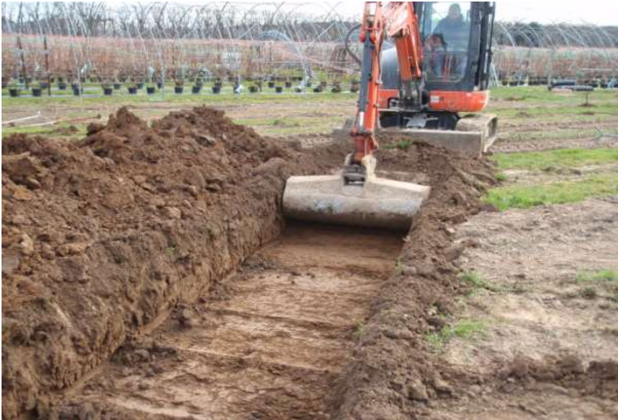
Plate 1 – Trench 1 under excavation (looking SE)