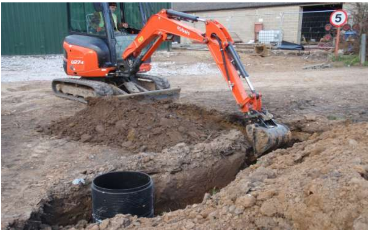
Plate 2 – Drainage connection (looking NW)